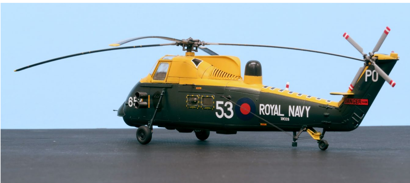
Three more shots of Mike Hirsch's 1:72 scale Westland Wessex HAS.3